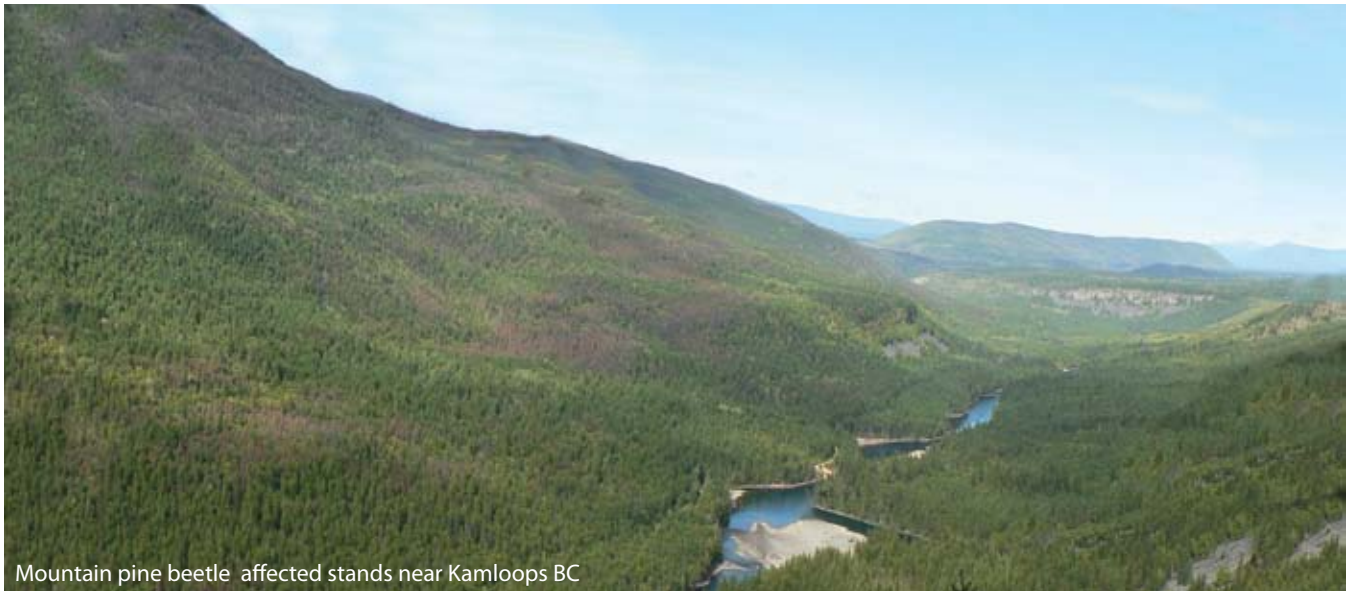
Mountain pine beetle affected stands near Kamloops BC