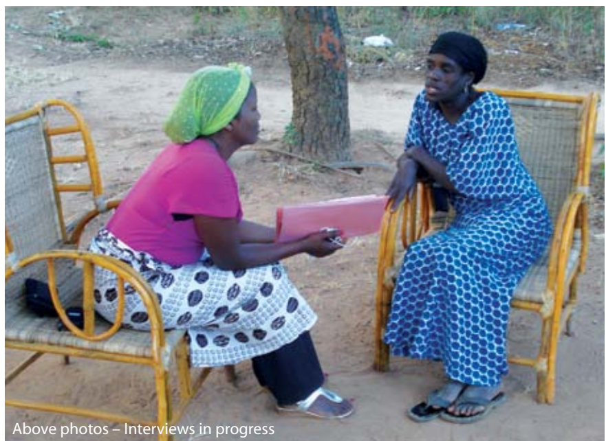
Above photos – Interviews in progress