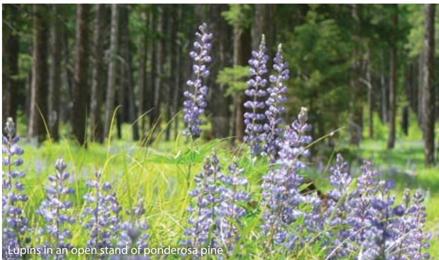
Lupins in an open stand of ponderosa pine