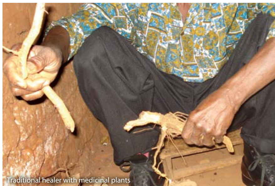
Traditional healer with medicinal plants

We also conducted a systematic analysis of the published and grey literature in this domain. The