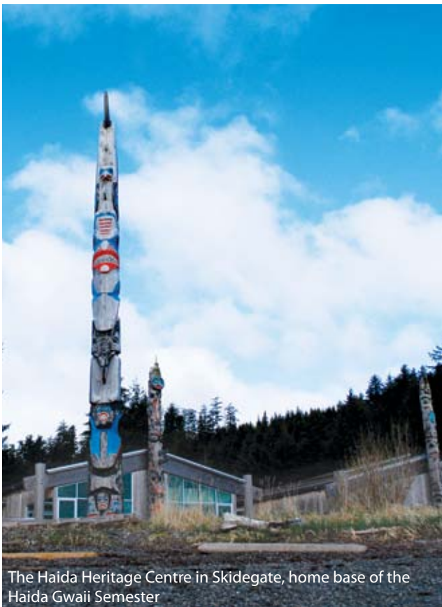
The Haida Heritage Centre in Skidegate, home base of the Haida Gwaii Semester

The Haida Gwaii Semester curriculum consisted of four three-week modular courses and a semester-long seminar course. Instructors used participatory approaches to student learning, and combined lectures