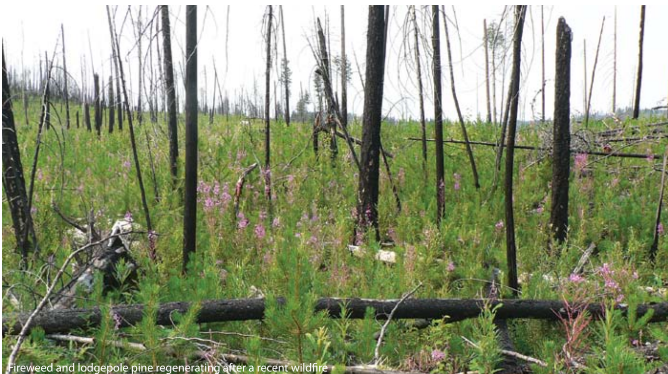
Fireweed and lodgepole pine regenerating after a recent wildfire