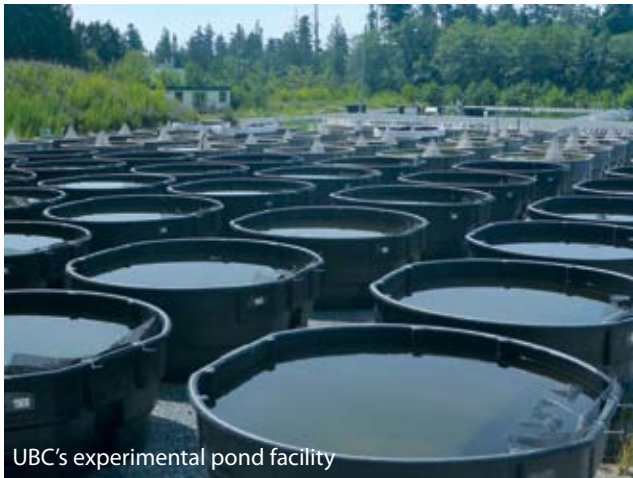
UBC's experimental pond facility