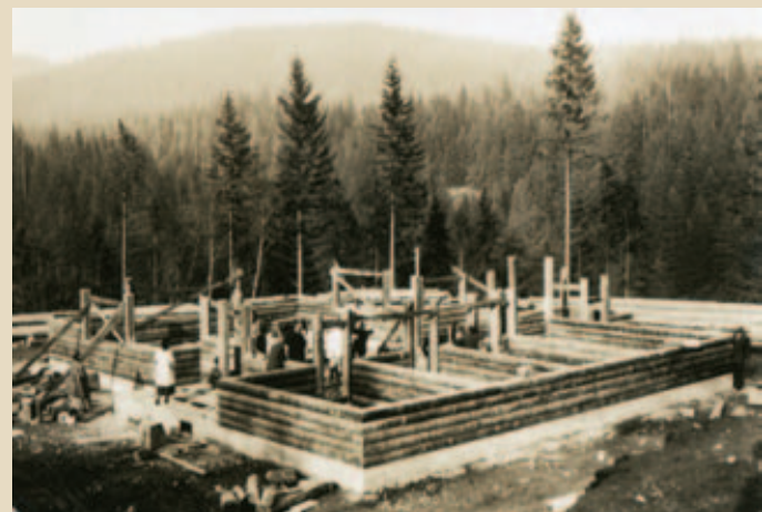
Visitors touring the partially built staff house, 1949.

"With the addition of the 9,800 acre Haney Research