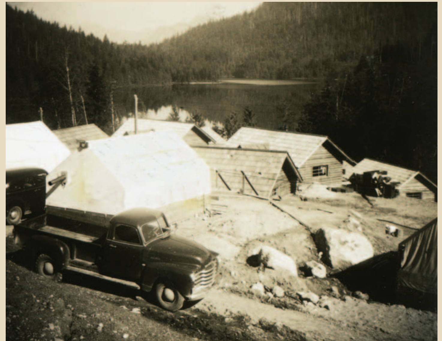
Forestry field camp, 1949.