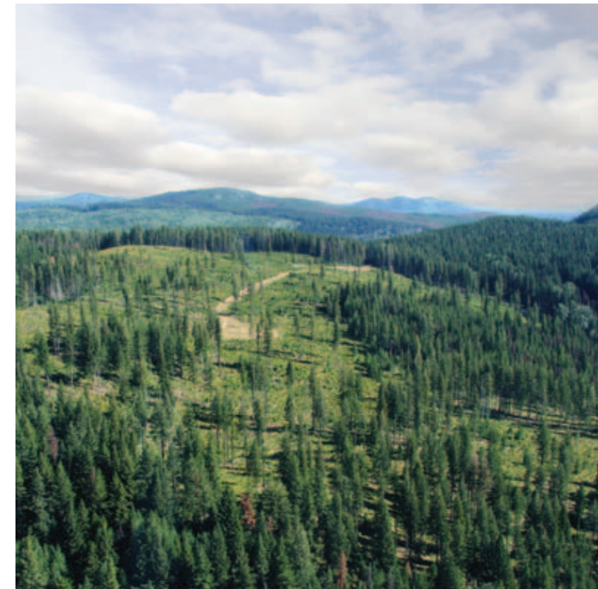
Block 101 (lower right), 102 (middle left) and 103 (upper foreground) are contiguous cutblocks at the Alex Fraser Research Forest, harvested from 1999-2000 to manage stand condition (50% lodgepole pine with increasing incidence of pine bark beetle) and site conditions (high wind exposure) with consideration of mule deer winter range objectives (retention of Douglas-fir canopy).

Plans must be at a sufficient resolution to give direction at the stand level, answering the question that a person developing a cutblock must ask; "What is the objective