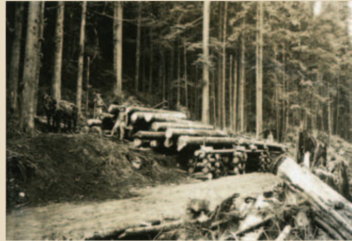
Horse logging for cabin building, 1948.

The cabins were strengthened using steel rods driven down through the walls. The corners of the cabins were