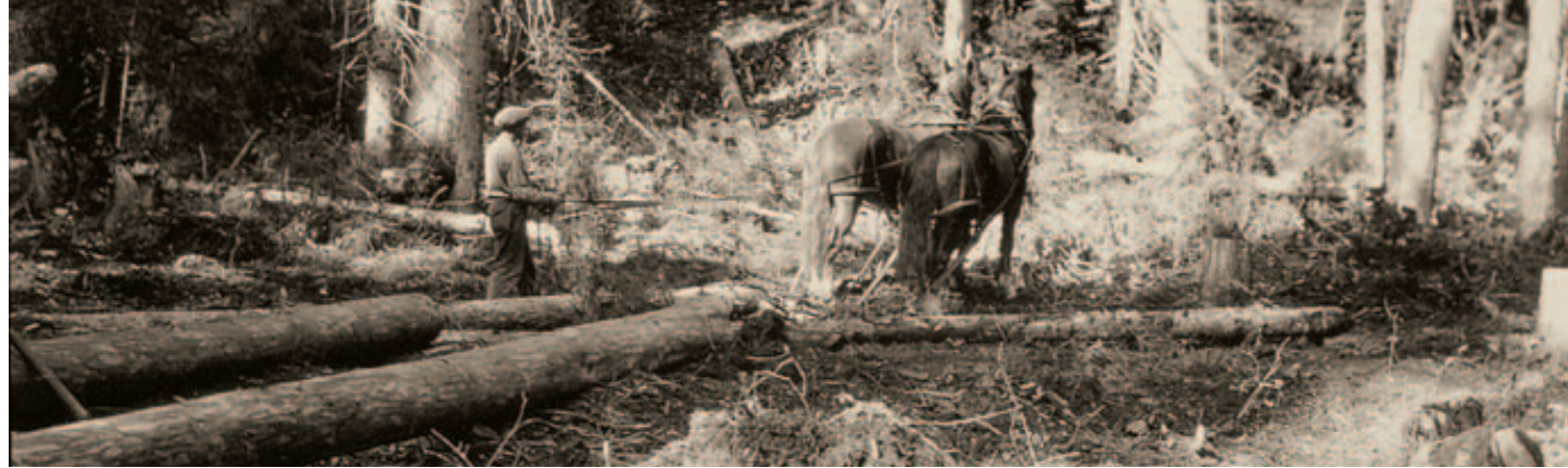
Horse logging at the Aleza Lake Experiment Station.

their productivity will be maintained or increased after logging, that valuable young growth may be established and brought to maturity at the least expense, and that waste in the forest through the agencies of fire, insects, decay, and improper utilization may be reduced to a minimum.