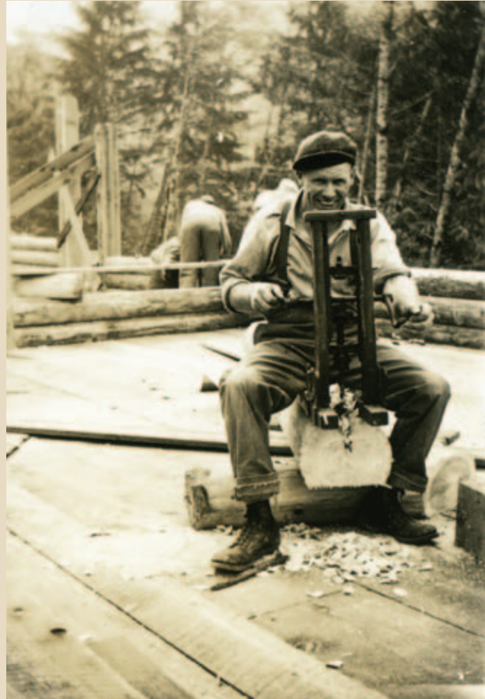
Cabin construction without electricity, 1948.