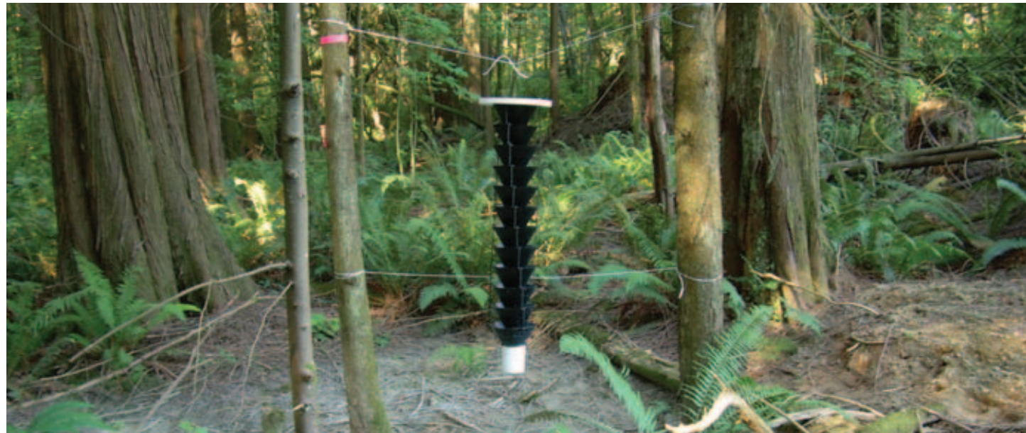
Pheromone traps for ambrosia beetles.